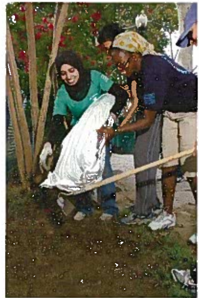
GW students planting a tree.

Countless hours continue to filter in from Greek organizations, student groups, and other members of the GW community looking to do their part and most of these efforts are not yet part of the university's official count. For example, the 104 brothers of Pi Kappa Alpha have already amassed 862 service hours toward the effort that will be included in future tabulations.